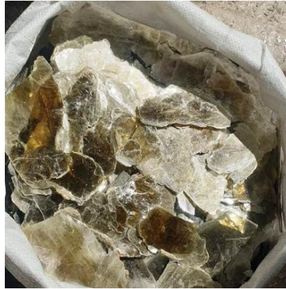
GREEN MICA SCRAP