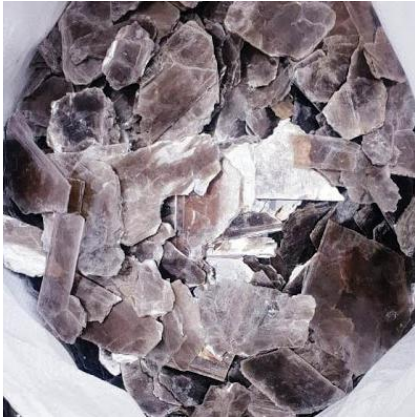
RUBY MICA SCRAP